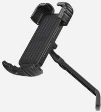
Rearview Mirror Mount

Installation position can be adjusted according to different needs and usage habits