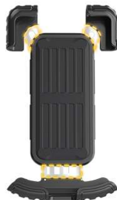
Mechanical Linkage Structure