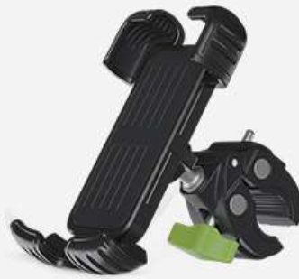
Crab Clamp Mount